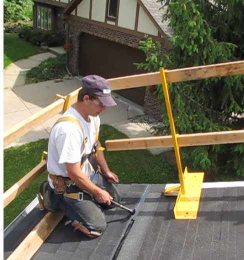
1) Shingle Up To Bottom of Bracket