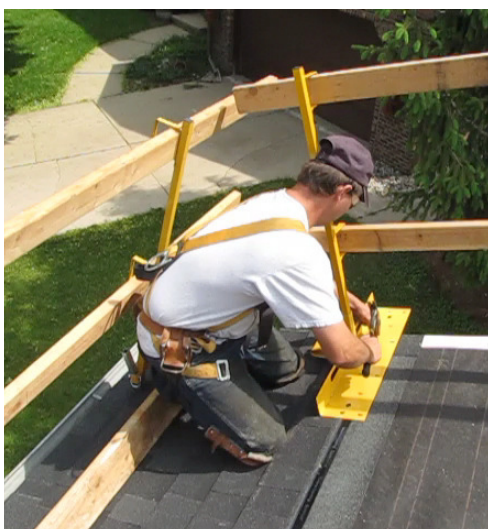
6) Secure All Other Nails