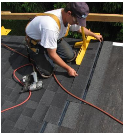
7) Continue Next Row of Shingles