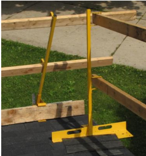
ACRO #12070 & New 12075