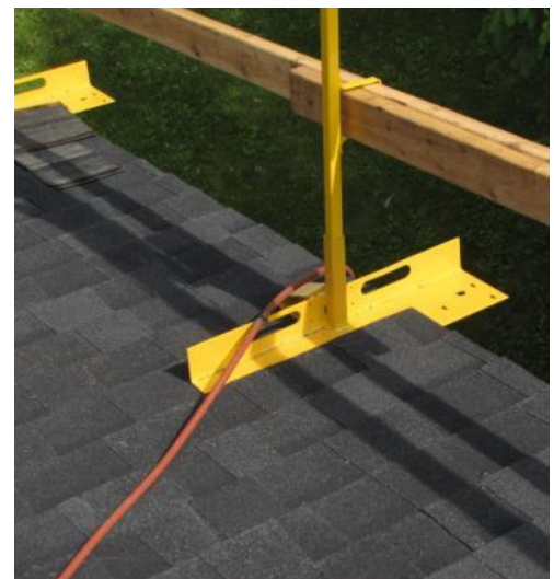
8) Fully Interleaved & Slotted for Removal