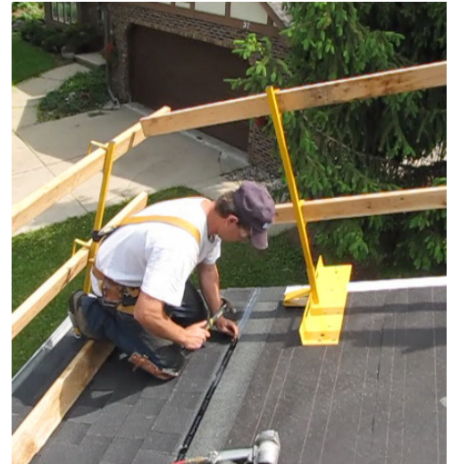
2) Locate Truss & Start Positioning Nail