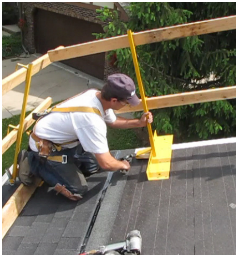
3) Knock Bracket Off from Initial Position