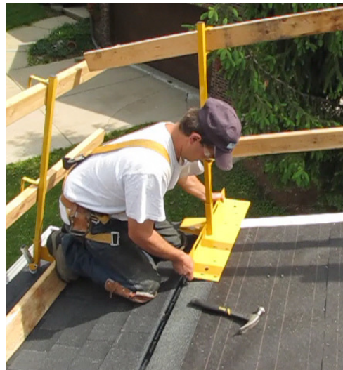
4) Move Bracket Down to Positioning Nail