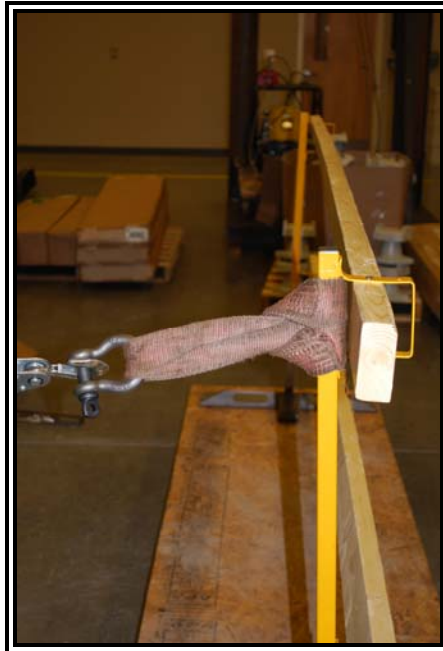
Figure 3: Lateral load test with handrail, prior to loading