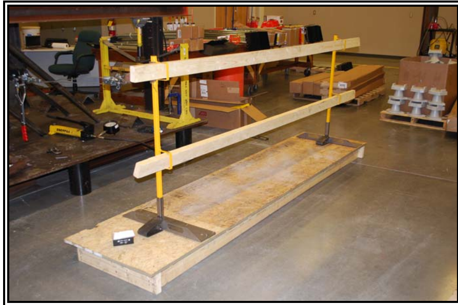
Figure 1: Assembled 12075 rail system with handrail installed