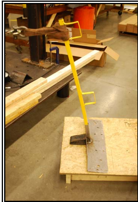
Figure 2: Stand-alone setup without handrail with load applied