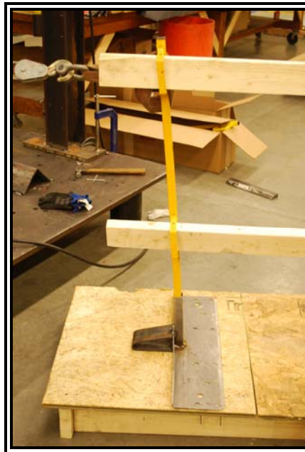
Figure 4: Longitudinal load test with handrail, load applied